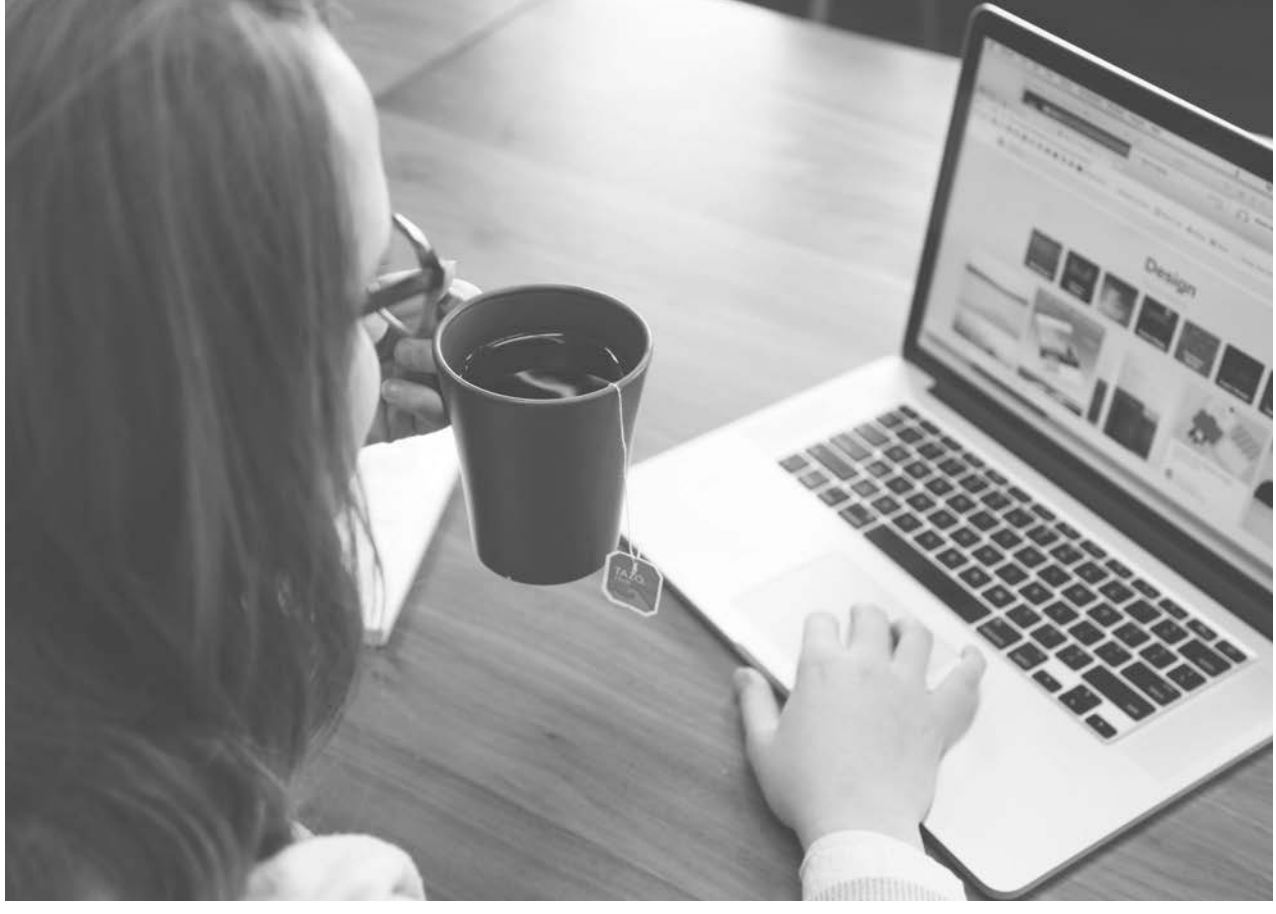
No better time than Summer to try an online class!

This section uses a ZERO-COST E-BOOK. Section 0245 is an online course. Log in the first day of class (6/10). Consult the web page for log on instructions and additional information.