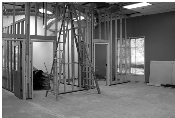
Student Services Remodel