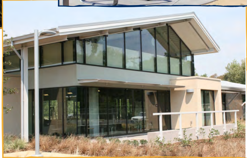
Pictured from left to right: Ukiah Campus Lake Center North County Center