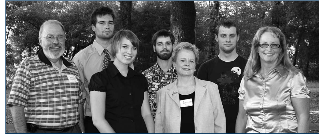
Foundation Board members presented awards to student scholarship recipients.