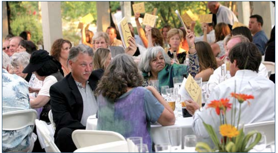
Guests enjoy the live auction and festive setting at Fetzer Vineyards Valley Oaks, site of the recent Gala on the Green.

A picture-perfect evening June 21 at Fetzer Vineyards Valley Oaks, Hopland, set the tone for what many are saying was the Foundation's "best ever" Gala on the Green. Nearly 300 guests supported this annual fundraiser that provides for student scholarships and a variety of educational programs at Mendocino College.